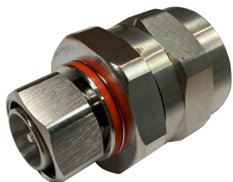
4.3-10 Male EZfit® Connector for 7/8 in AVA5-50 and AVA5-50FX cable